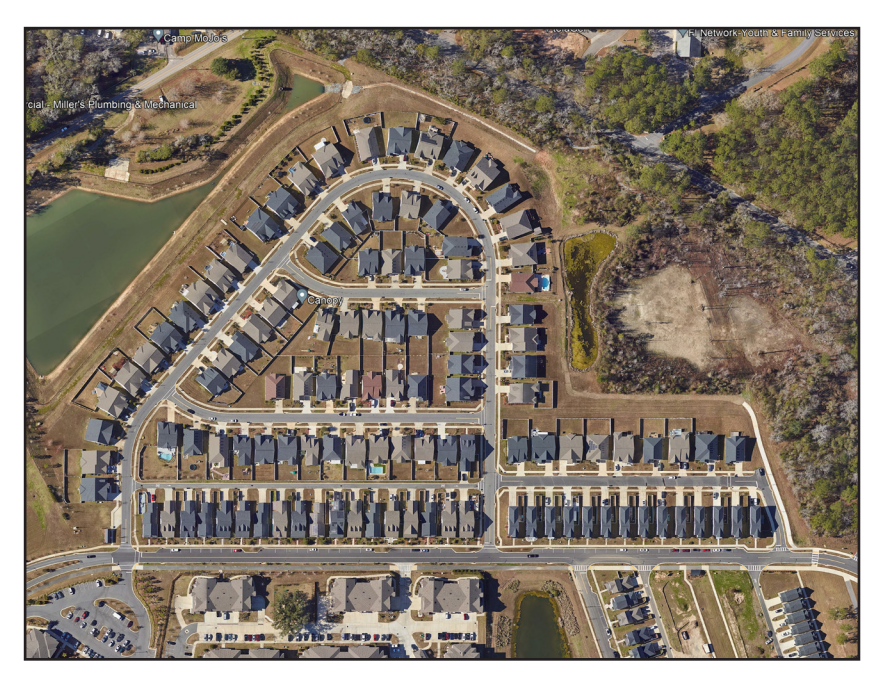
Aerial of Completed Subdivision in Canopy Development

8. What's the difference between a preliminary plat and a final plat? A preliminary plat shows the location of the lots, the roads, the stormwater ponds, and all other infrastructure, but nothing is yet