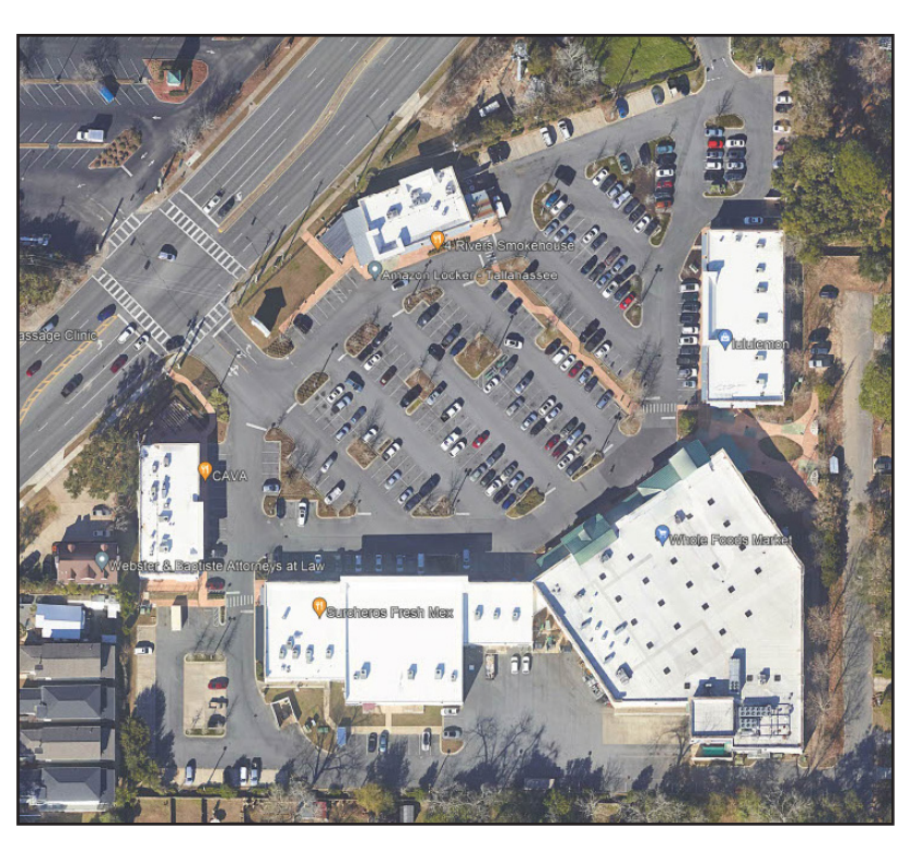
Aerial Showing Completed Whole Foods at Miracle Plaza

3. What does a site plan application look like? In the past, site plans were submitted on paper. Today, they are submitted electronically through the City's online permitting portal as PDF files. They always include multiple pages to address the individual issues listed in the answer to the next question. One of the site plan pages for the Whole Foods on Thomasville Road is shown above as an example, along with an aerial that illustrates how the finished construction matches the site plan.